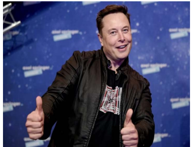
"Canadian truckers rule." Elon Musk