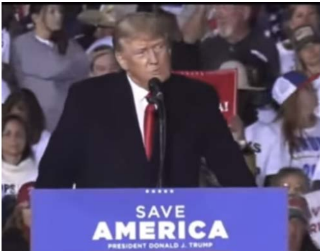
"Canadian truckers...doing more to defend American freedom than our own leaders by far...we are with them all the way." Donald Trump